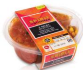
SNACK FOOD | A-PET