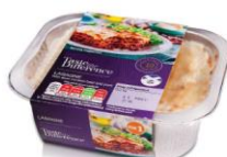
READY MEALS | SMOOTH WALL FOIL