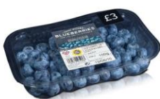
PRODUCE | A-PET

Transformers are available to accommodate the electrical supplies in different countries