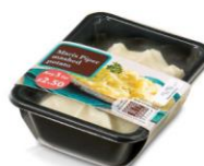
READY MEALS | C-PET