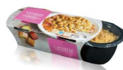
PUDDING | C-PET

for more information UK +44 (0) 1625 856 600 America +1 804 447 9038 Australia +61 (0) 3 9397 0955